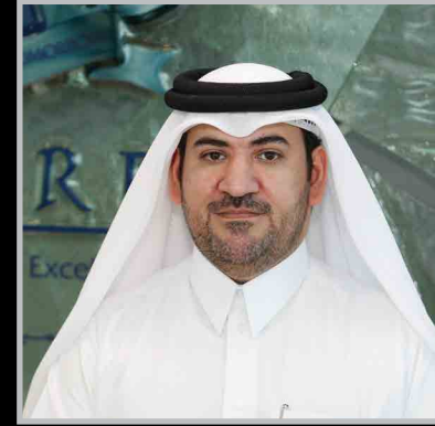
Jassem Al Jaber School Principal

Dear Graduates, I wish you a bright future as champions whom we are all proud about.